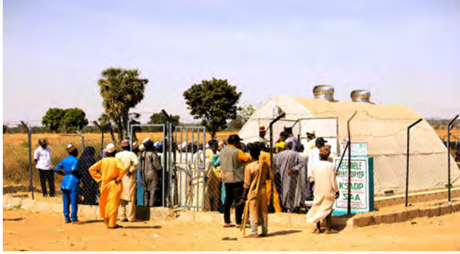
Journalists visit a KSADP vegetable tent dryer during 2023 media field day in Thomas community, Makoda LGA Kano state.