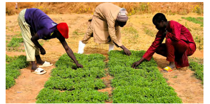
KSADP dry season vegetable farmers tending to a Nursery during a field visit to Garun Mallam LGA

THIS NEWSLETTER IS PRODUCED BY SASAKAWA AFRICA ASSOCIATION IN COLLABORATION WITH THE KANO STATE AGROPASTORAL DEVELOPMENT PROJECT (KSADP).