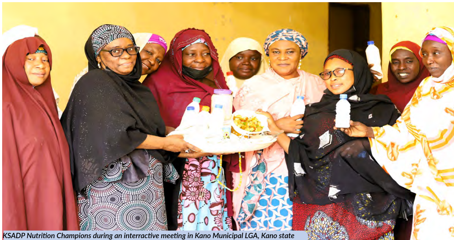
KSADP Nutrition Champions during an interactive meeting in Kano Municipal LGA, Kano state

S oy cake, “soy meat steaks” maize couscous, soy noodles, tombrown , and a vast array of soy-based drinks are some of the nutritious and delicious food and drinks recently displayed by some women trained in complementary foods production and income generation under the KSADP/SAA project. The training was conducted by IITA and ICRISAT, KSADP/SAA project partners, to build the capacity of women in the production of nutritious foods and drinks from grains for household nutrition and income generation.