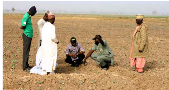
KSADP Technical officers on Regenerative Agriculture interacting with beneficiaries during a field visit to Kura LGA