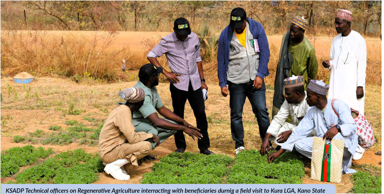
KSADP Technical officers on Regenerative Agriculture interacting with beneficiaries during a field visit to Kura LGA, Kano State

Following the commencement of the establishment of the KSADP/SAA 2024 dry season demonstration plots for vegetables in Kano State, demo host farmers and cluster members are expressing awe at the early results coming from the nurseries. The Project is currently establishing 150 dry-season vegetable demos across the 44 local government areas of the state as part of efforts to introduce farmers to good agronomic practices, improved varieties and climate-smart production technologies.