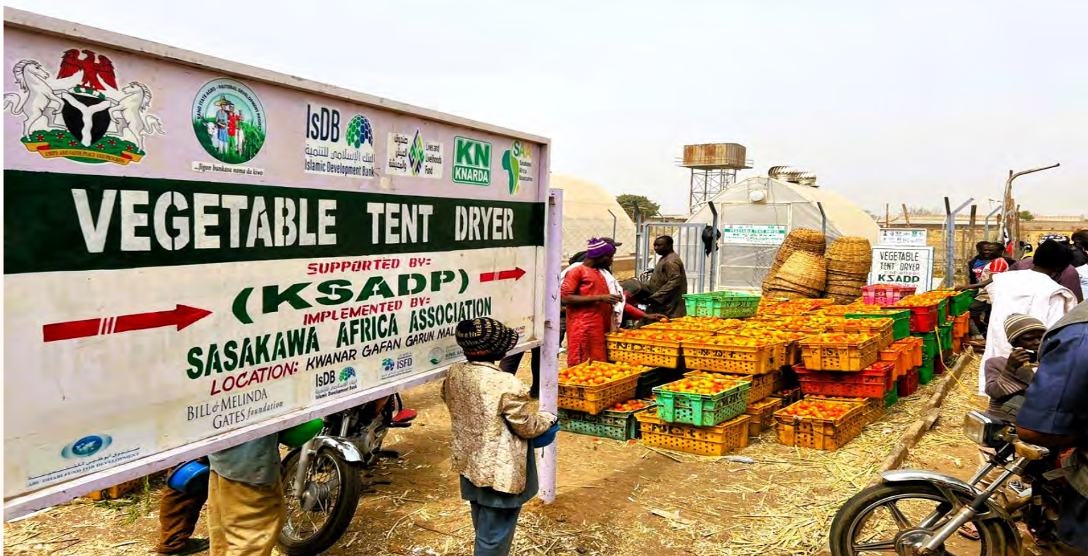
KSADP Vegetable tent dryer in Garun Mallam LGA, Kano state